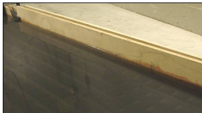
Figure 4: Bending of foil through steel net