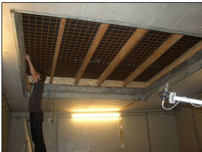
Figure 3: Testing of leakage of sound by stethoscope

After filling the basin with water, the structure was tested for leakage of sound by the use of a stethoscope (figure 3). Gaps were detected between the water layer and the edge beams, due to curving of the foil. Foam strips and putty were used to close the gaps and successfully stop the leakage of sound.