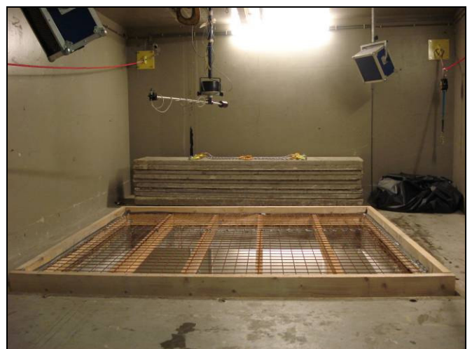
Figure 1: Water layer supporting structure

To be able to measure the sound insulation of the water layer only, a supporting structure was constructed in the 10 m 2 floor opening (3.16 x 3.16 m 2 ) with almost no sound insulation. For this a steel net with 10 x 10 mm 2 mesh was constructed on top of a wooden beam structure (see figure 1). Higher wooden beams were placed on the edge of the floor opening to create an edge for the water basin and to avoid sound leakage along the edges.